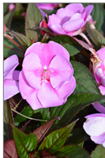
SunPatiens Vigorous Lavender Splash New Guinea Impatiens flowers