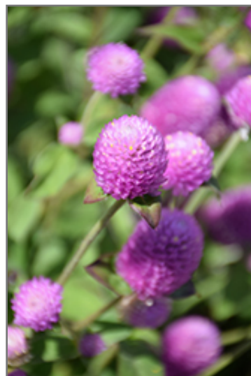
Ping Pong Lavender Globe Amaranth flowers