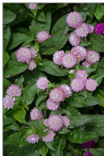
Ping Pong Lavender Globe Amaranth flowers