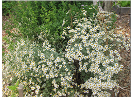
German Chamomile

This plant is quite ornamental as well as edible, and is as much at home in a landscape or flower garden as it is in a designated herb garden. It does best in full sun to partial shade. It is very adaptable to both dry and moist locations, and should do just fine under typical garden conditions. It is not particular as to soil type or pH. It is somewhat tolerant of urban pollution. This species is not originally from North America.