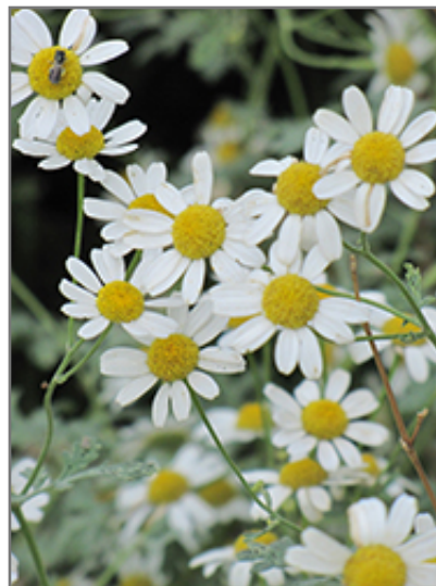
German Chamomile flowers