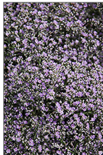
Sea Lavender flowers