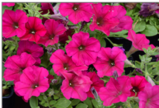
Wave Carmine Velour Petunia flowers

Wave Carmine Velour Petunia is recommended for the following landscape applications;