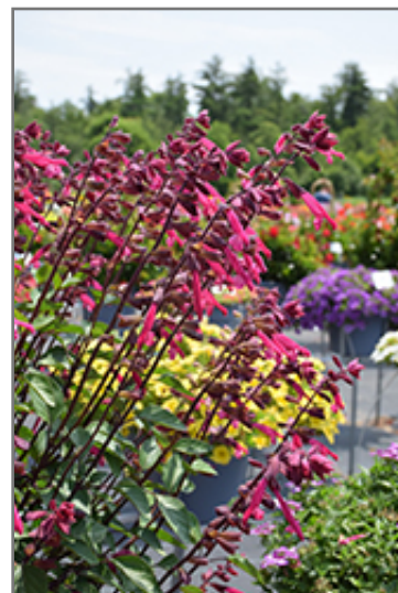
Skyscraper Dark Purple Salvia flowers

Skyscraper Dark Purple Salvia is an herbaceous annual with an upright spreading habit of growth. Its relatively fine texture sets it apart from other garden plants with less refined foliage.