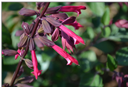
Skyscraper Dark Purple Salvia flowers