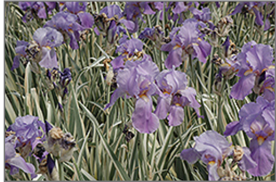
Variegated Sweet Iris flowers