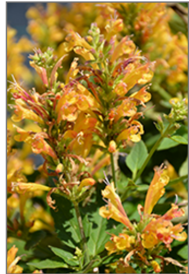
Poquito Butter Yellow Hyssop flowers