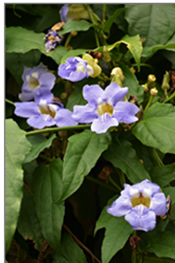
Blue Trumpet Vine flowers