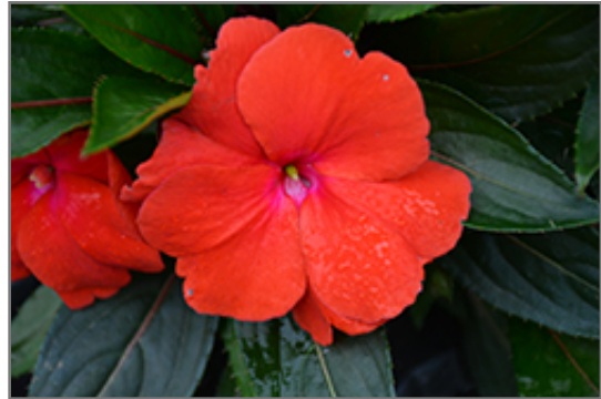
Magnum Red Flame New Guinea Impatiens flowers