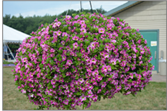
Candy Shop Candy Crush Calibrachoa in bloom

Candy Shop Candy Crush Calibrachoa will grow to be about 14 inches tall at maturity, with a spread of 14 inches. When grown in masses or used as a bedding plant, individual plants should be spaced approximately 12 inches apart. Its foliage tends to remain dense right to the ground, not requiring facer plants in front. This fast-growing annual will normally live for one full growing season, needing replacement the following year.