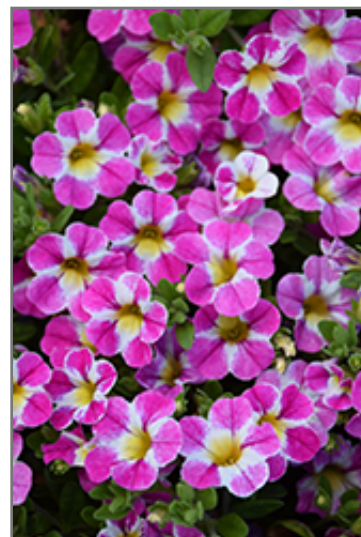
Candy Shop Candy Crush Calibrachoa flowers

Candy Shop Candy Crush Calibrachoa is recommended for the following landscape applications;