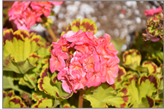
Glitterati Diva Queen Geranium flowers