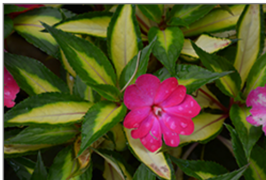
SunPatiens Compact Tropical Rose New Guinea Impatiens flowers

SunPatiens Compact Tropical Rose New Guinea Impatiens is a fine choice for the garden, but it is also a good selection for planting in outdoor containers and hanging baskets. It can be used either as 'filler' or as a 'thriller' in the 'spiller-thriller-filler' container combination, depending on the height and form of the other plants used in the container planting. It is even sizeable enough that it can be grown alone in a suitable container. Note that when growing plants in outdoor containers and baskets, they may require more frequent waterings than they would in the yard or garden.