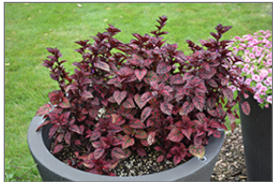
Hippo Red Polka Dot Plant