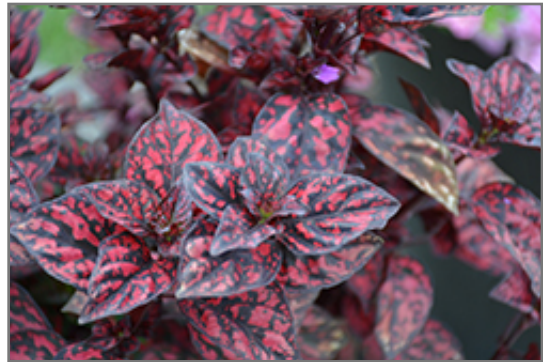
Hippo Red Polka Dot Plant foliage