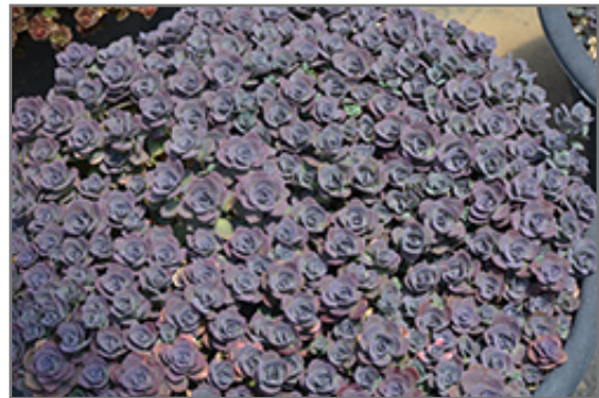
SunSparkler Blue Elf Sedoro