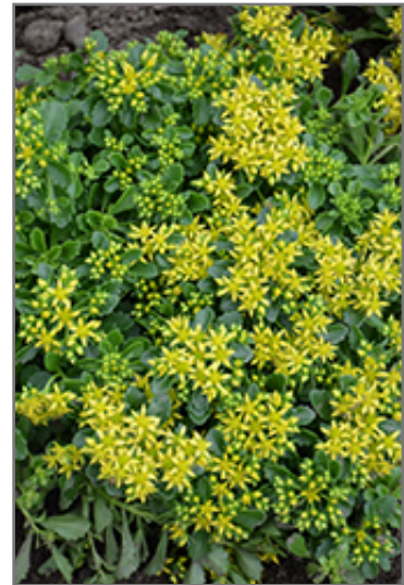
Little Miss Sunshine Stonecrop flowers

Little Miss Sunshine Stonecrop is recommended for the following landscape applications;