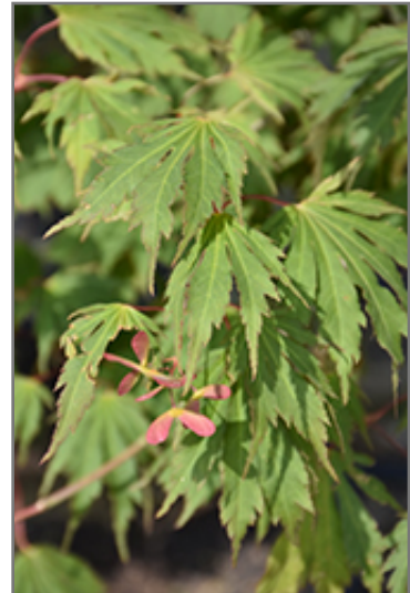
Northern Glow Maple foliage