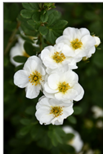
Creme Brulee Potentilla flowers