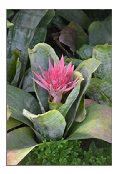
Urn Plant in bloom