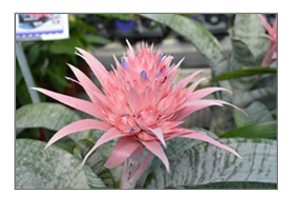
Urn Plant flowers

This is an herbaceous evergreen houseplant with a shapely form and gracefully arching foliage. Its relatively coarse texture stands it apart from other indoor plants with finer foliage. This plant should never be pruned unless absolutely necessary, as it tends not to take pruning well.