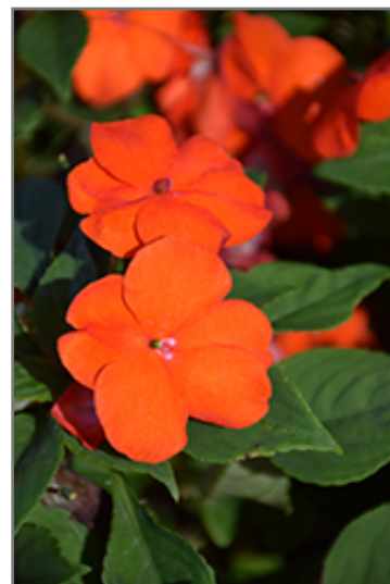
Lollipop Orange Impatiens flowers