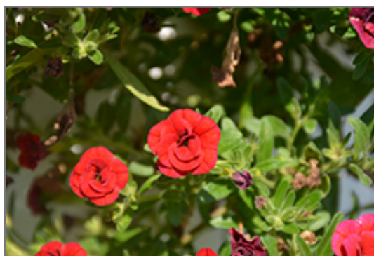
MiniFamous Double Compact Red Calibrachoa flowers