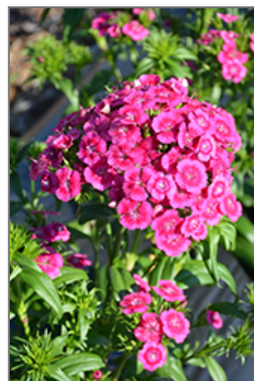
Jolt Pink Hybrid Pinks flowers