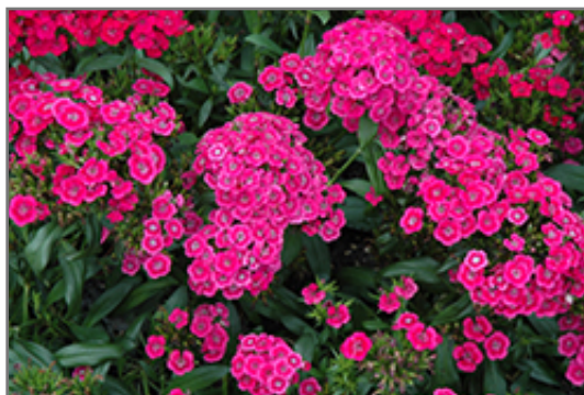
Jolt Pink Hybrid Pinks flowers

Jolt Pink Hybrid Pinks is recommended for the following landscape applications;