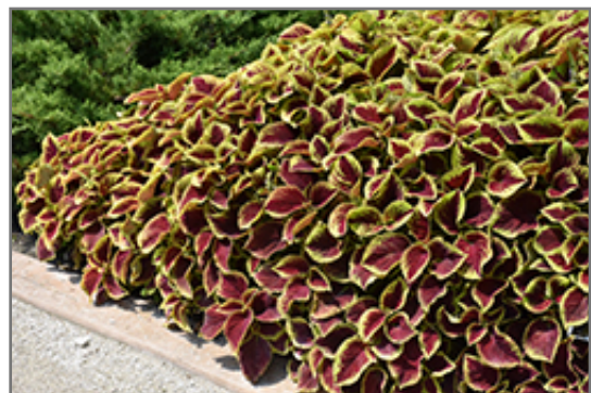
Premium Sun Crimson Gold Coleus