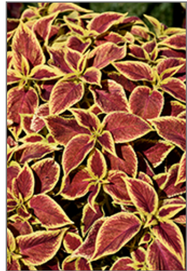
Premium Sun Crimson Gold Coleus foliage

Premium Sun Crimson Gold Coleus is recommended for the following landscape applications;