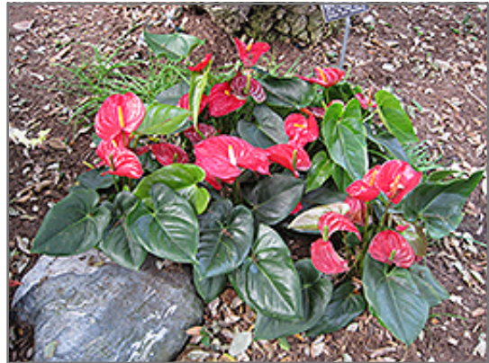
Anthurium flowers