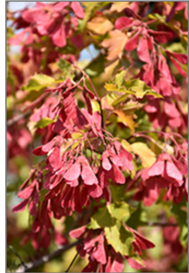
Amur Maple (tree form) fruit

This tree does best in full sun to partial shade. It is very adaptable to both dry and moist locations, and should do just fine under average home landscape conditions. It is not particular as to soil type or pH. It is highly tolerant of urban pollution and will even thrive in inner city environments. This is a selected variety of a species not originally from North America.