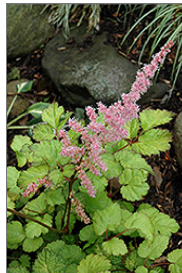
Amber Moon Chinese Astilbe flowers