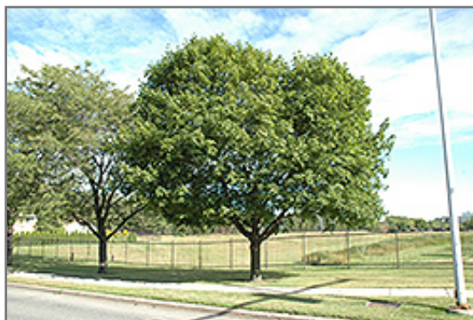
Norway Maple