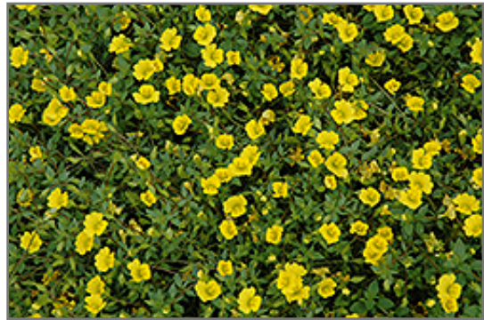
Magic Carpet Yellow Mecardonia flowers