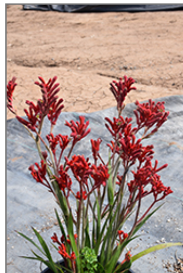
Kanga Red Kangaroo Paw in bloom