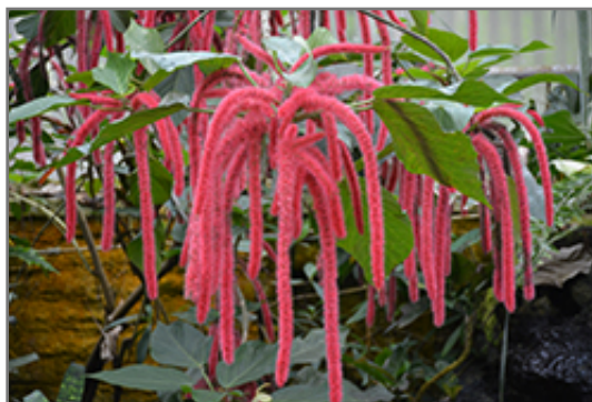
Firetail Chenille Plant flowers