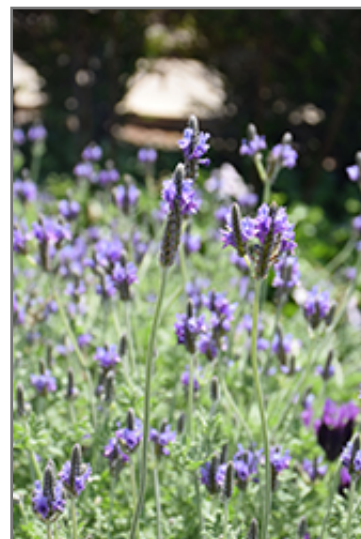
Fernleaf Lavender flowers