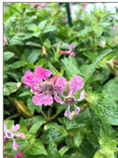
Sriracha Pink Cuphea flowers