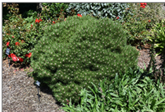
Bambino Dwarf Austrian Pine