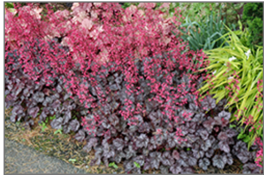
Glitter Coral Bells in bloom

Glitter Coral Bells is recommended for the following landscape applications;