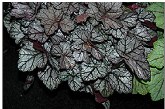
Glitter Coral Bells foliage