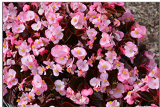
Nightife Pink Begonia flowers