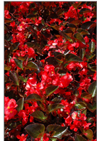
Big Red Bronze Leaf Begonia flowers