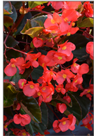
Big Red Bronze Leaf Begonia flowers

Big Red Bronze Leaf Begonia is a fine choice for the garden, but it is also a good selection for planting in outdoor containers and hanging baskets. It is often used as a 'filler' in the 'spiller-thriller-filler' container combination, providing a mass of flowers and foliage against which the larger thriller plants stand out. Note that when growing plants in outdoor containers and baskets, they may require more frequent waterings than they would in the yard or garden.