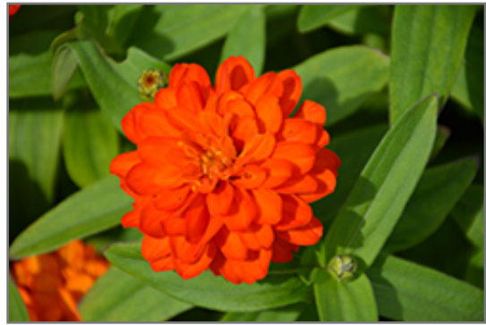
Profusion Double Fire Zinnia flowers