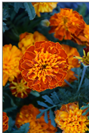
Bonanza Harmony Marigold flowers