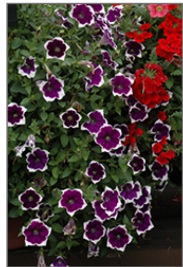
Cascadias Rim Violet Petunia flowers