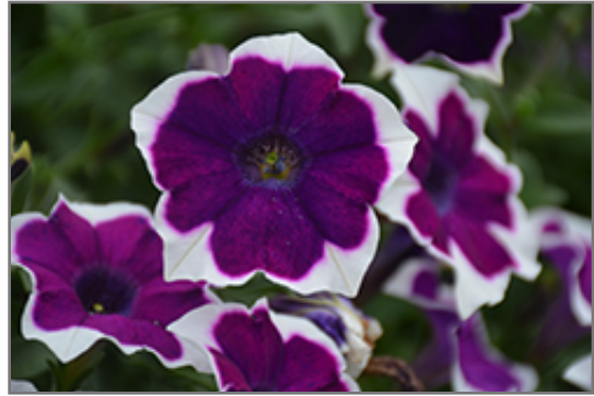
Cascadias Rim Violet Petunia flowers