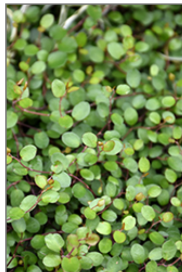
Creeping Wire Vine foliage