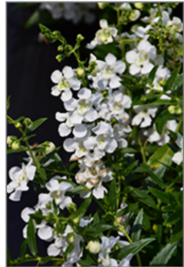
AngelMist Spreading White Angelonia flowers

AngelMist Spreading White Angelonia is recommended for the following landscape applications;