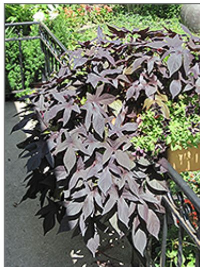
Proven Accents Blackie Sweet Potato Vine