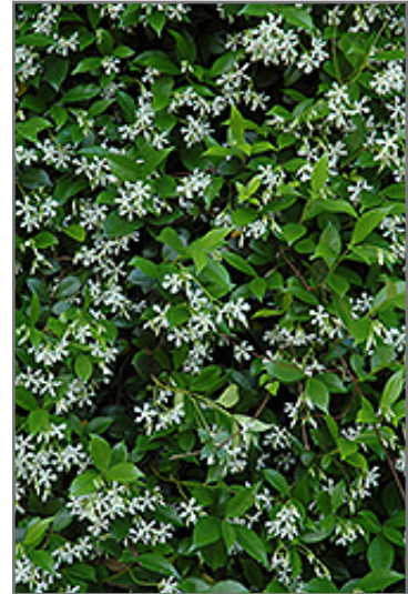
Confederate Star-Jasmine flowers