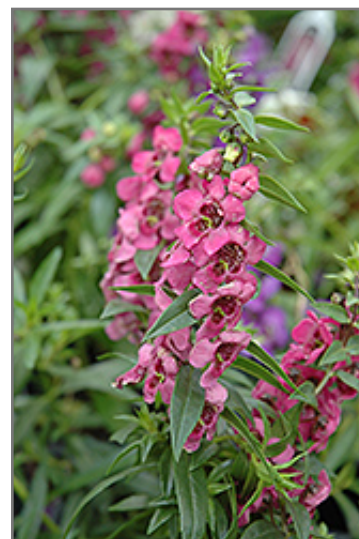
Pink Angelonia flowers