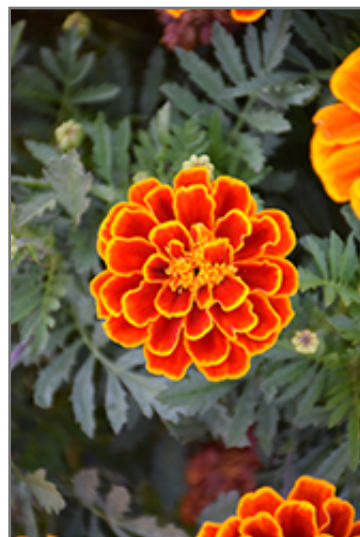
Durango Flame Marigold flowers

Durango Flame Marigold will grow to be about 10 inches tall at maturity, with a spread of 8 inches. When grown in masses or used as a bedding plant, individual plants should be spaced approximately 6 inches apart. Its foliage tends to remain low and dense right to the ground. This fast-growing annual will normally live for one full growing season, needing replacement the following year.