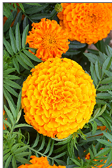
Taishan Orange Marigold flowers

Taishan Orange Marigold will grow to be about 12 inches tall at maturity, with a spread of 10 inches. When grown in masses or used as a bedding plant, individual plants should be spaced approximately 8 inches apart. Its foliage tends to remain dense right to the ground, not requiring facer plants in front. This fast-growing annual will normally live for one full growing season, needing replacement the following year.