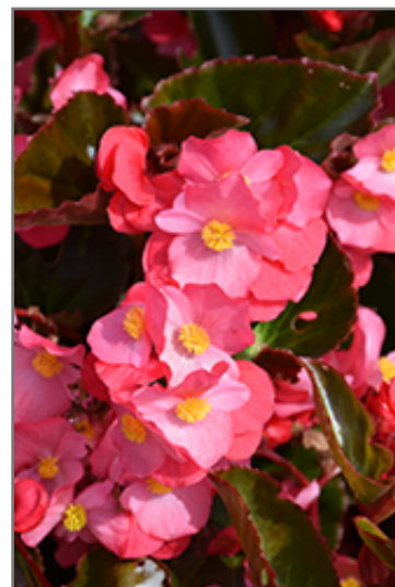
Big Rose Bronze Leaf Begonia flowers

Big Rose Bronze Leaf Begonia is recommended for the following landscape applications;