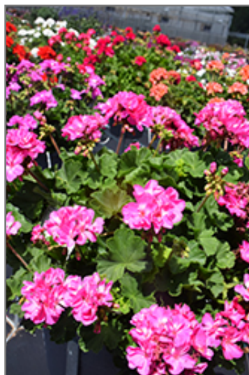
Fantasia Shocking Pink Geranium in bloom