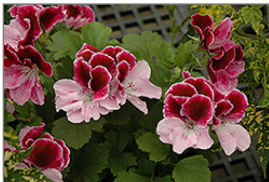
Elegance Purple Majesty Geranium flowers